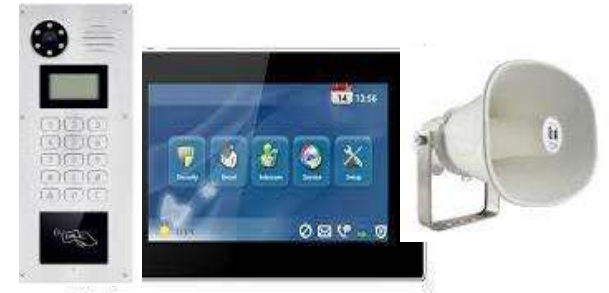
INTERCOM/ PAGING & BGM